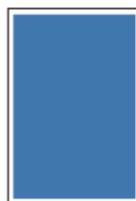
1/1 page, type area 128 x 196 mm